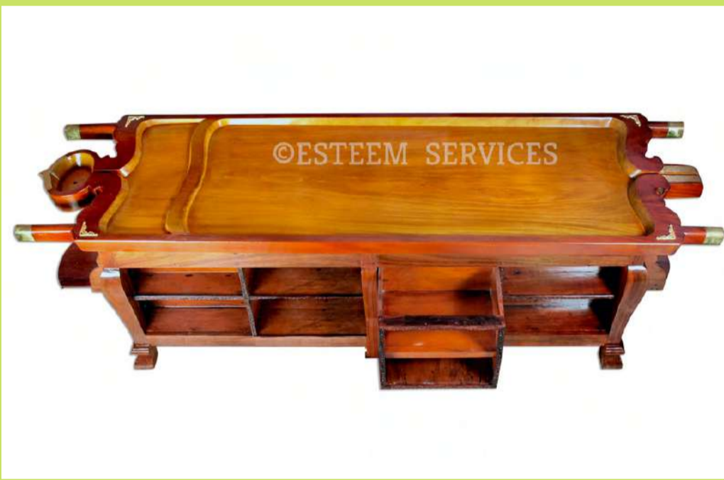
C WOODEN DHRONI ON OPEN SHELF TABLE WITH DRAWER