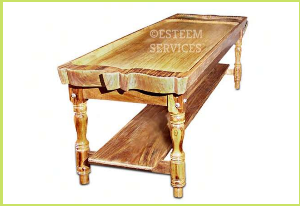
N SHORT LENGTH DHRONI WITH STORAGE PLANK