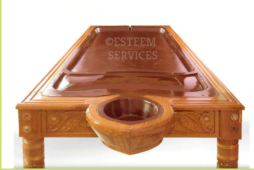
I FIBER DHRONI ON DECORATIVE ALL AROUND TABLE