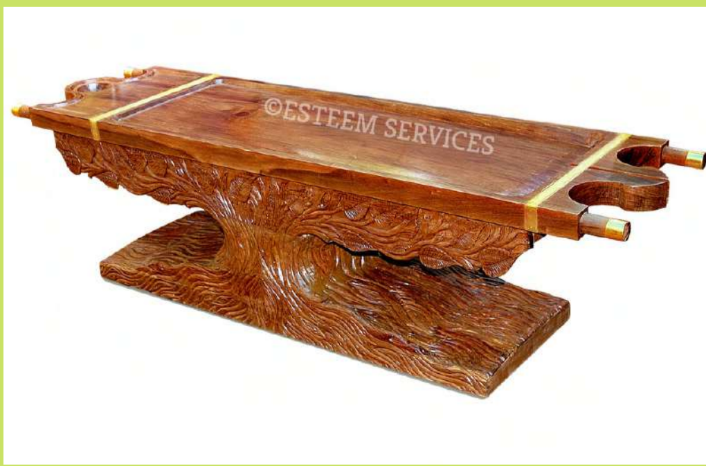
G WOODEN DHRONI ON BANYAN TREE BASE