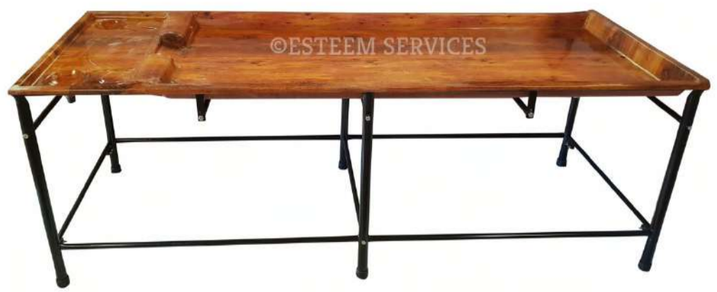
Wood Design Model