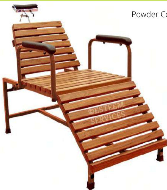
Powder Coated Steel Model