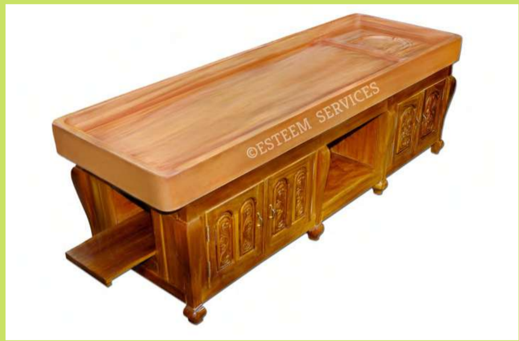
D RECTANGULAR DHRONI ON SHELF TABLE