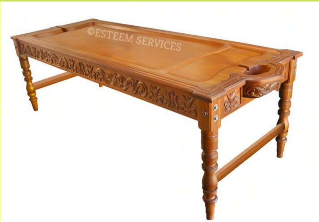
O SHIRODHARA TABLE WITH ALL AROUND CARVINGS