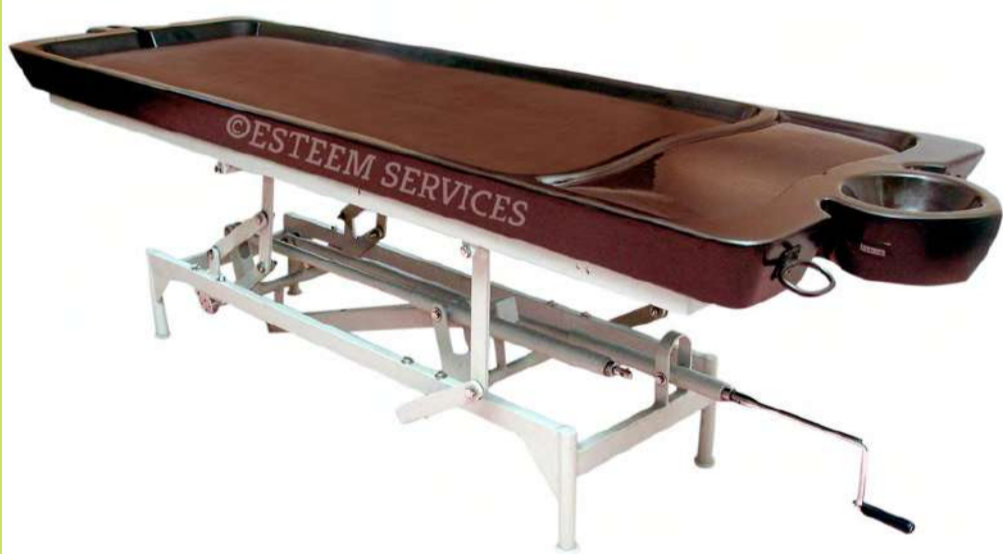
With Tilt Model