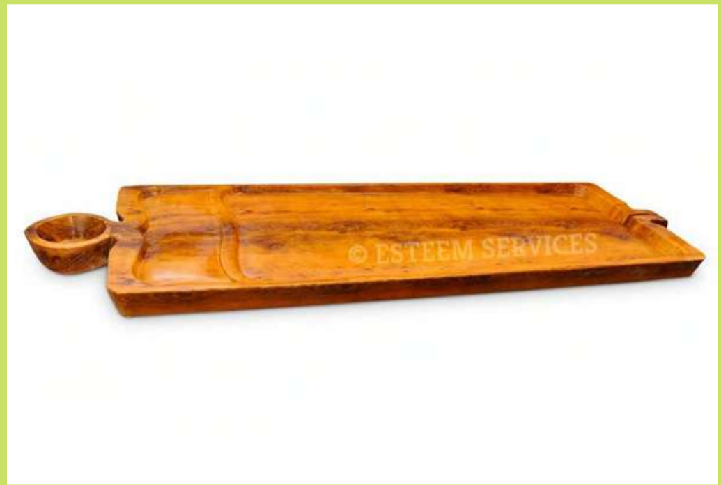
L FIBER DHRONI ( Jungle Wood Finish )