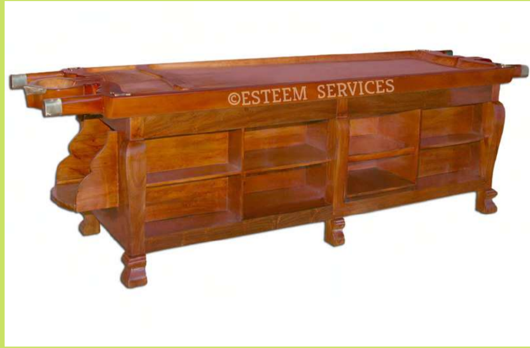
B WOODEN DHRONI ON OPEN SHELF TABLE (Walnut Finish)