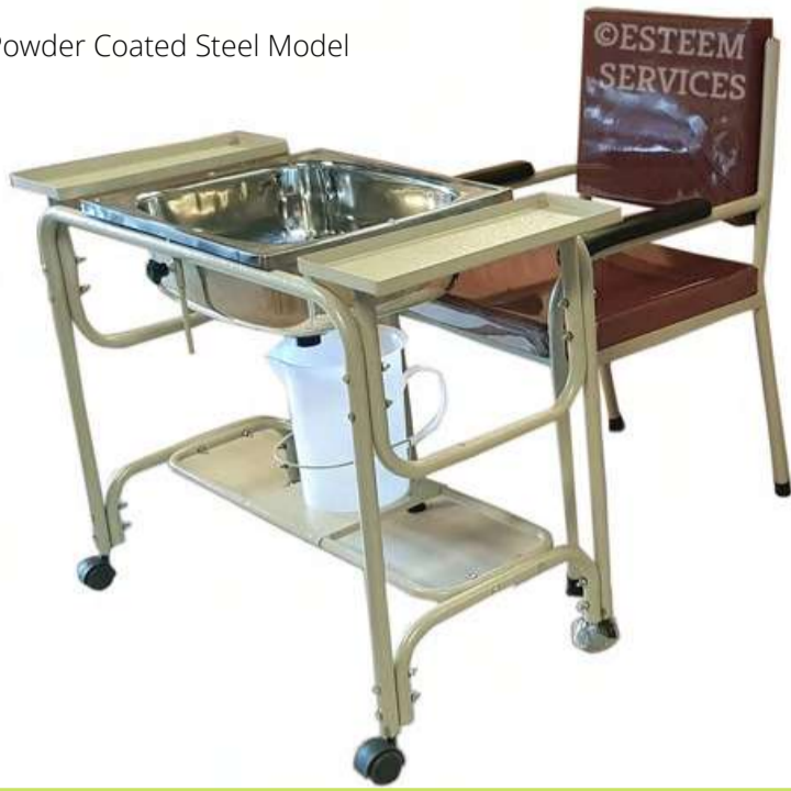
Powder Coated Steel Model