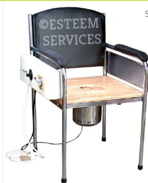
Stainless Steel Model