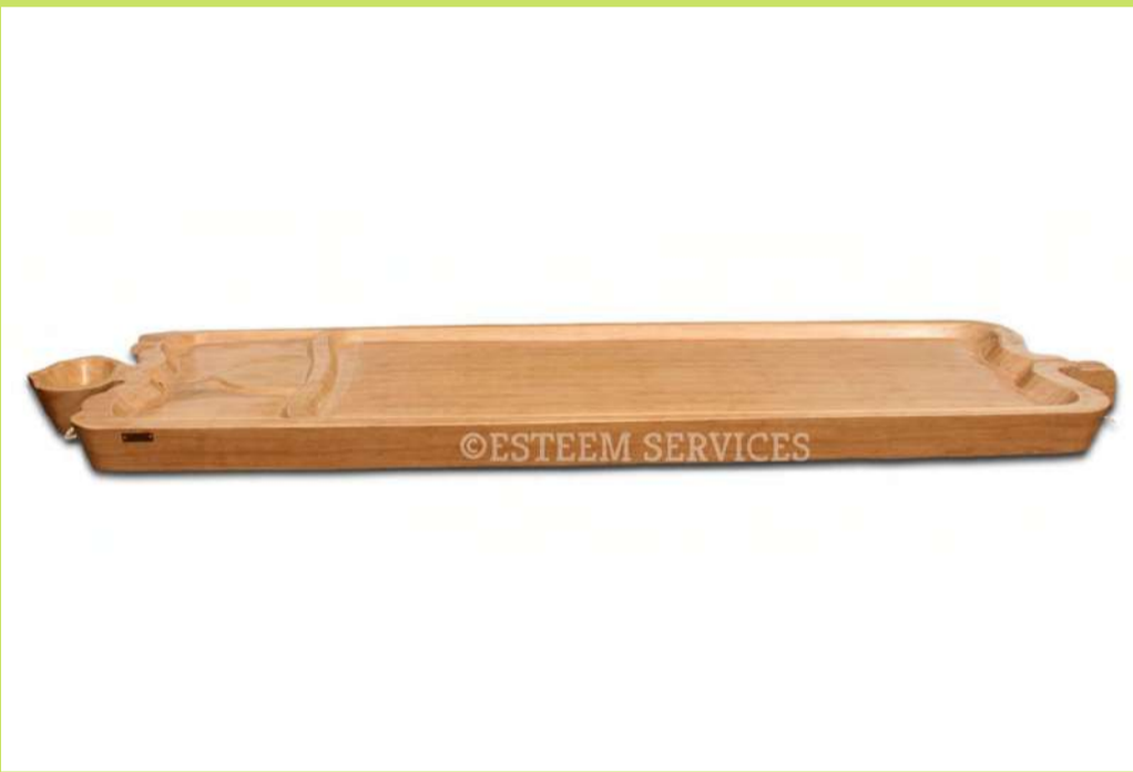
K FIBER EXTRA WIDE DHRONI ( Cedar Wood Finish )