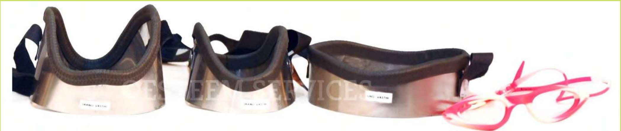
JAAU VASTHI (B)