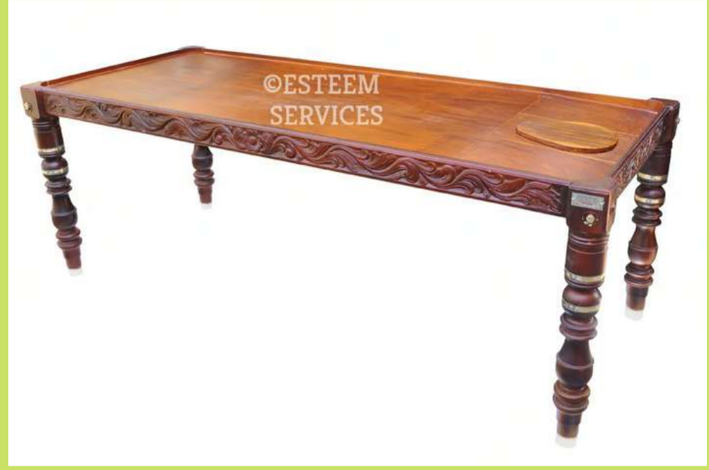
J WOODEN MASSAGE TABLE WITH FACE HOLE & LID