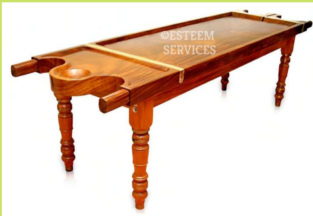
M SHORT BOWL WOODEN SHIRODHARA TABLE