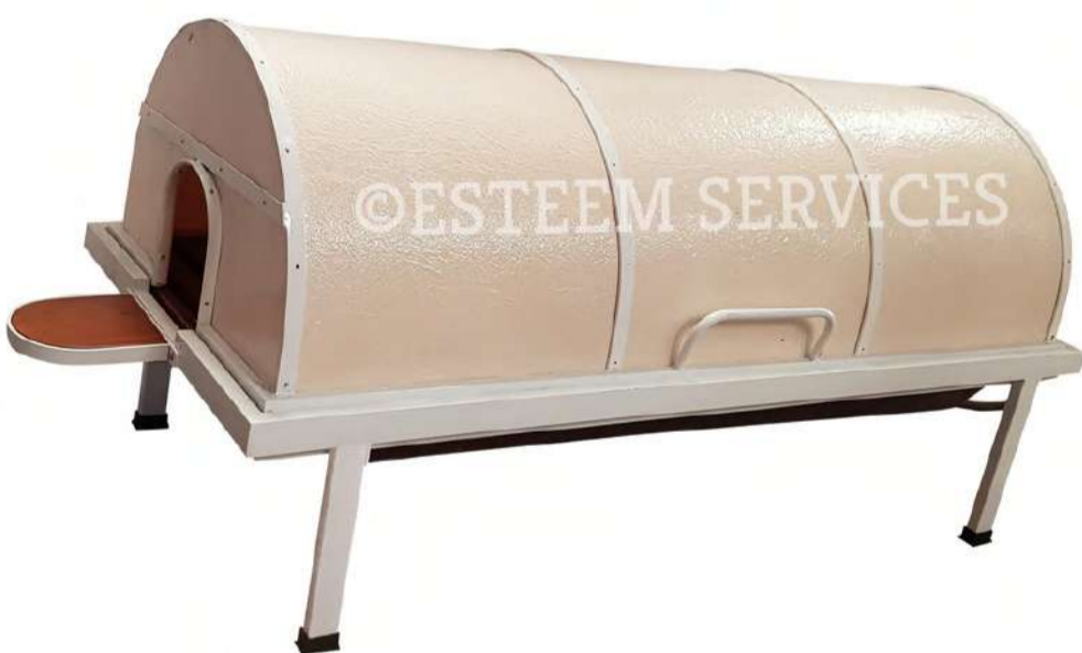
Powder Coated Steel Model

Width of the door of the treatment room should be at least 80 cm to suit the width of chamber.