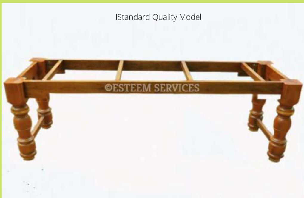
Standard Quality Model