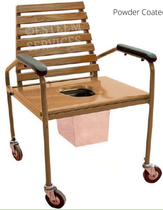
Powder Coated Steel Model