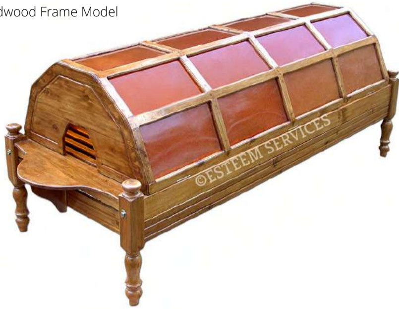
Hardwood Frame Model

Width of the door of the treatment room should be at least 86 cm to suit the width of chamber.