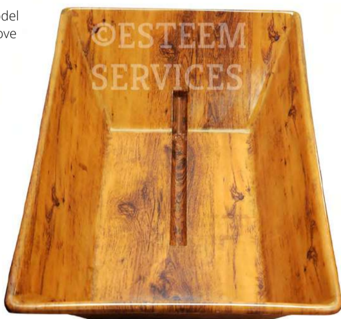
Export Model with Groove