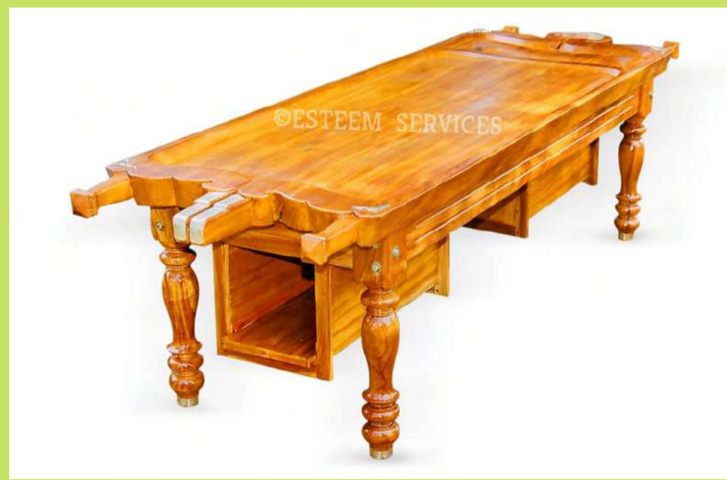
E WOODEN DHRONI ON TABLE WITH OIL VESSEL DRAWERS