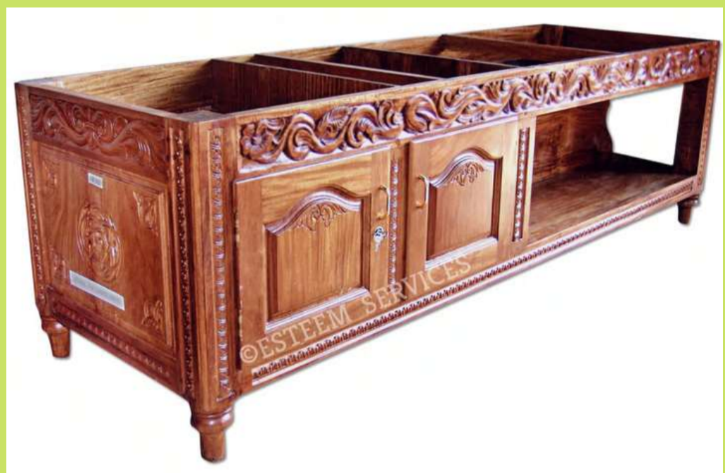
F DECORATIVE HALF CABINET TABLE