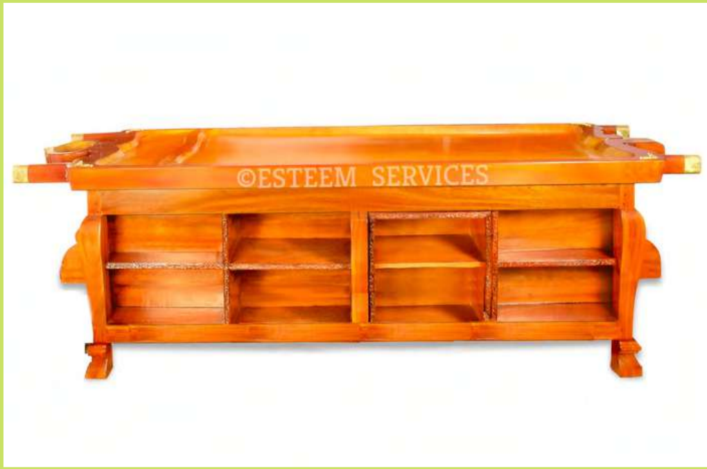
A WOODEN DHRONI ON OPEN SHELF TABLE ( Natural Anjali )