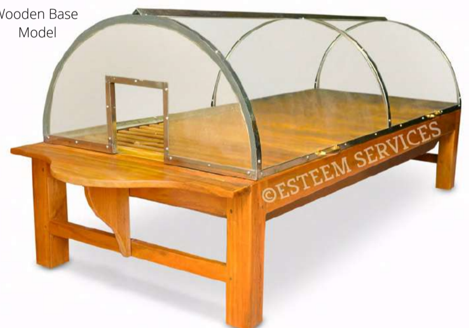
Wooden Base Model

Width of the door of the treatment room should be at least 86 cm to suit the width of chamber.